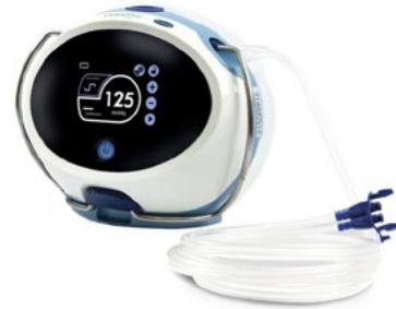
Negative Pressure Wound Therapy