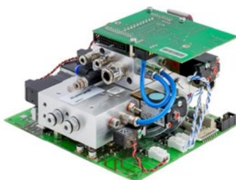
Digital Gas Mixer