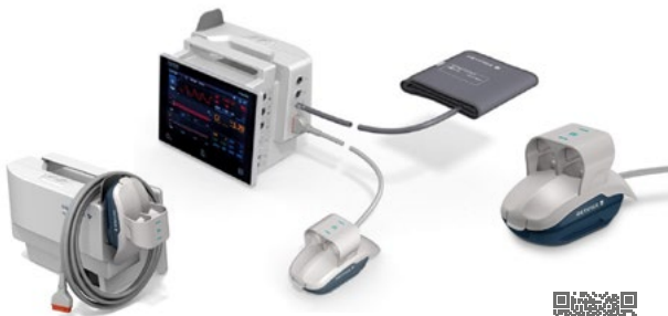
Blood Pressure and HZV Monitoring