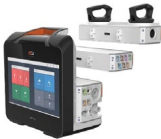
Modular Docking Station "Jenny"