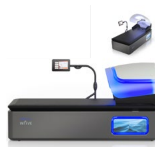
Dry water massage bed