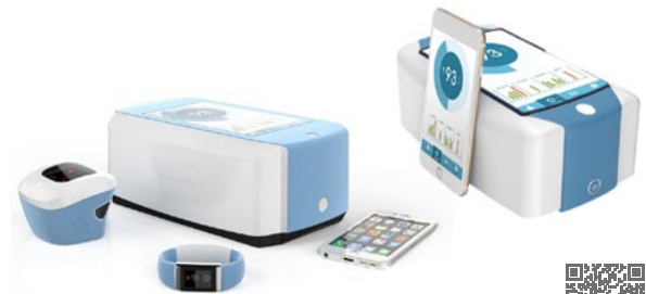
Non-Invasive CGM System